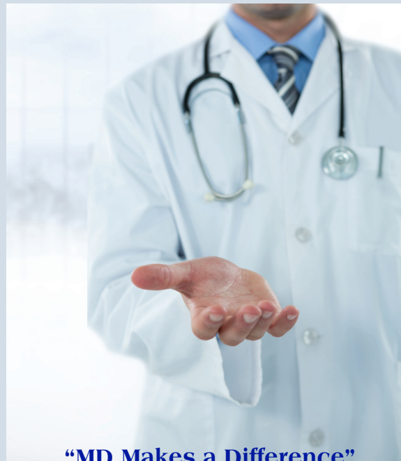
"MD Makes a Difference"

Did you know that less than 5% of Medical Residents stay in Connecticut after training- it is because we need Tort Reform and more legislation controlling the egregious behavior of the insurance industry, who put profit over care. Help us make Connecticut a better place for quality medical care.